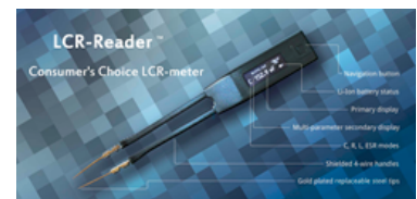
LCR-Reader Akin to Smart Tweezers LCR-meter

The simpler LCR-Reader does not offer some seldom used functionalities of Smart Tweezers ST-5S but does offer L-C-R as well as ESR (Equivalent Series Resistance) measurement that is very important for electrolytic capacitors. In