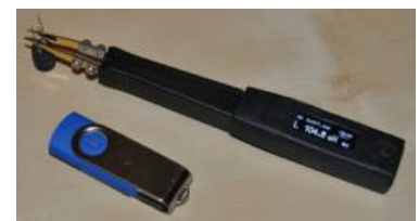
LCR-Reader: The Lightest LCR-meter

A new member of the Smart Tweezers LCR-meter family, LCR-Reader has finally arrived with the first batch of devices being manufactured. The new device replaces previous model of Smart Tweezers ST5L production of which was stopped in June 2013. LCR-Reader, presented to the public last April is shown on the right. It is very similar to Smart Tweezers in the way it is used.