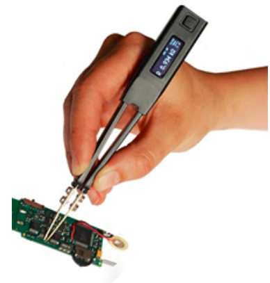
LCR-Reader, the Ultimate LCR-meter for SMT

Surface Mount Technology is the leading method for building electronic equipment using components that are mounted directly onto the Printed Circuit Board (PCB) as opposed to the previous method where wire leads were threaded through holes on the PCB. The small components used are called Surface Mount Devices or SMDs and are