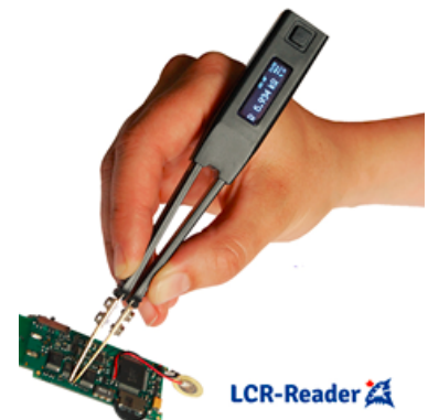
LCR-meter from Siborg Systems Inc.