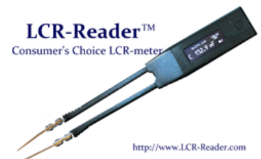
LCR-Reader from Siborg Systems Inc.

Smart Tweezers first began in the early 2000's and have become a global success for the unique design that combines a set of tweezers and an LCR-meter in a nearly pen-sized one-handed use device. The