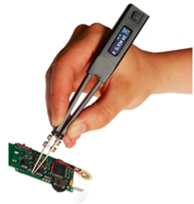
Smart Tweezers ST-5S

Siborg Systems Inc. has recently made new deals with resellers in Vietnam and Thailand. With the help from these companies, Smart