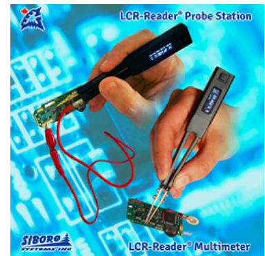
LCR-Reader and the Kelvin Probe Connector

Smart Tweezers LCR-meter have been the choice model among professionals, especially those on production lines, since their introduction in the early 00's. This model offers the most features, with extensive menus for customized measurements, and the highest basic accuracy of 0.2%. The 4-way joystick like navigation allows users to easily switch basic settings from the default screen. This model offers features not available on the LCR-Reader, such as offset subtraction,