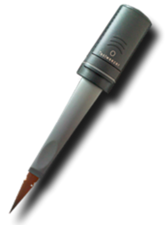
Smart LED Test Tweezers

The device has a very solid and durable design and consists of a 15cm long ABS body that only weighs 50 grams. It is suited for engineers and other professionals and personnel that need a portable device to take in-field, the Smart LED Test Tweezers easily fit into a bag or pocket.