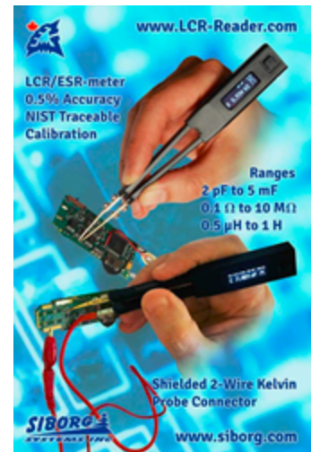
LCR-Reader and the Probe Connector

LED Tester Tweezers with 12 VDC output and adjustable current ratings of 5, 10 and 20 mA. This device combines a set of tweezers to test LEDs and can also test SMT and circuits when connected