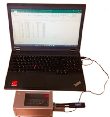
Siborg's new calibration fixture testing an LCR-Reader LCR and ESR meter